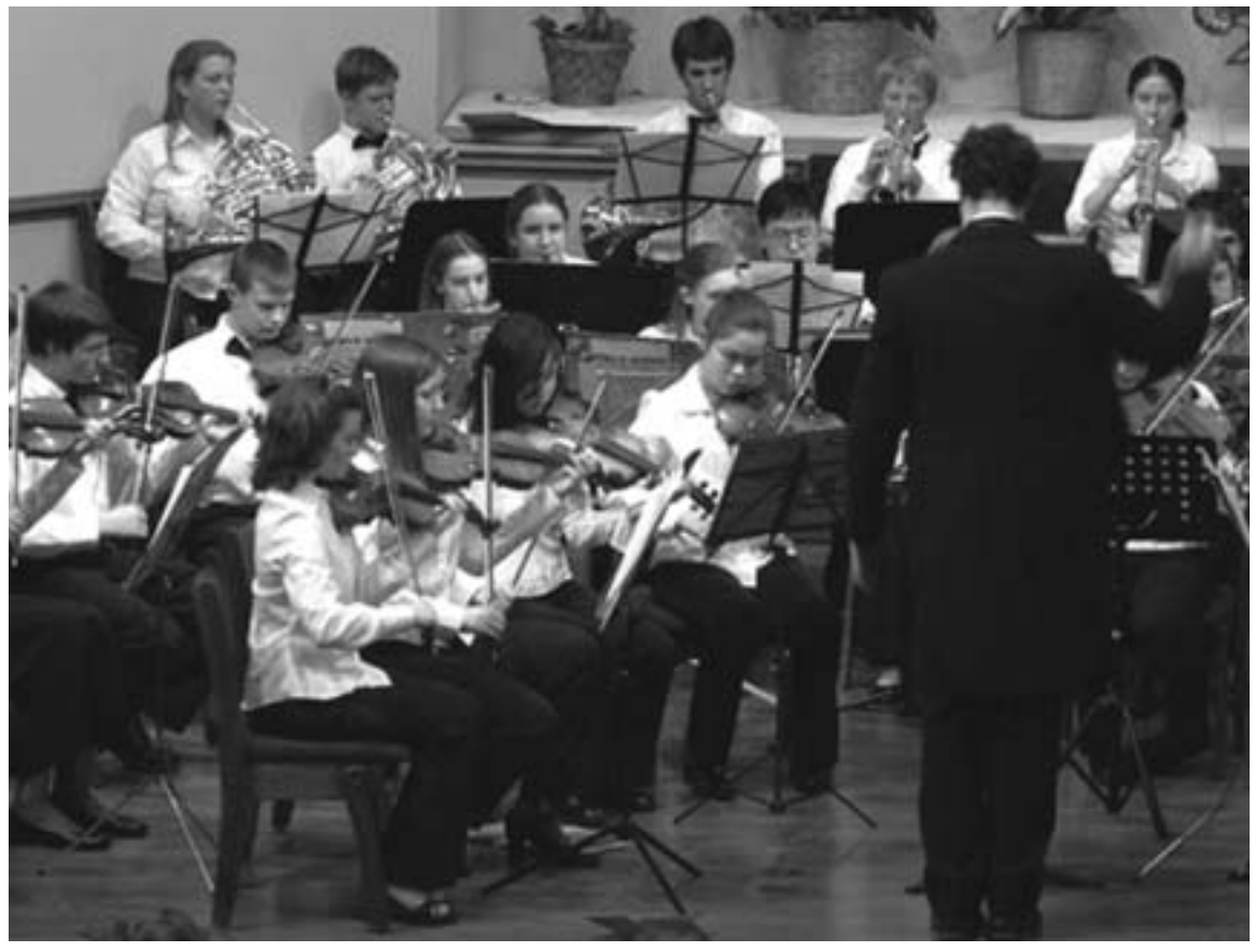
FREDERICK YOUTH ORCHESTRA

FOR THE DOCUMENTATION, PRESERVATION, INTERPRETATION AND PROMOTION OF FOLKLIFE AND FOLK ARTS.