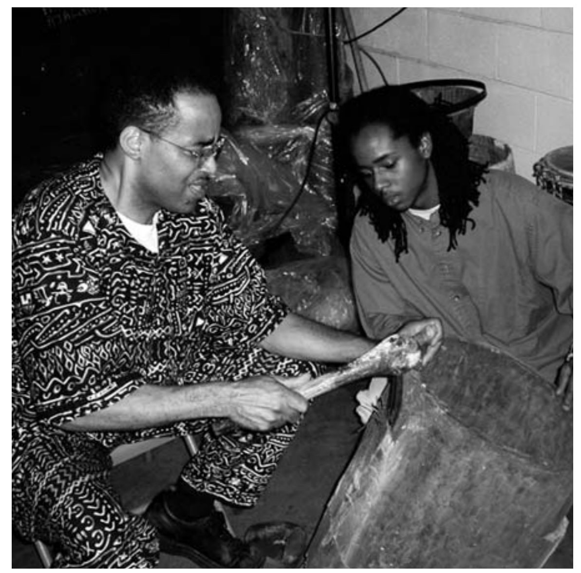
MARYLAND TRADITIONS APPRENTICESHIP PROGRAM Baile