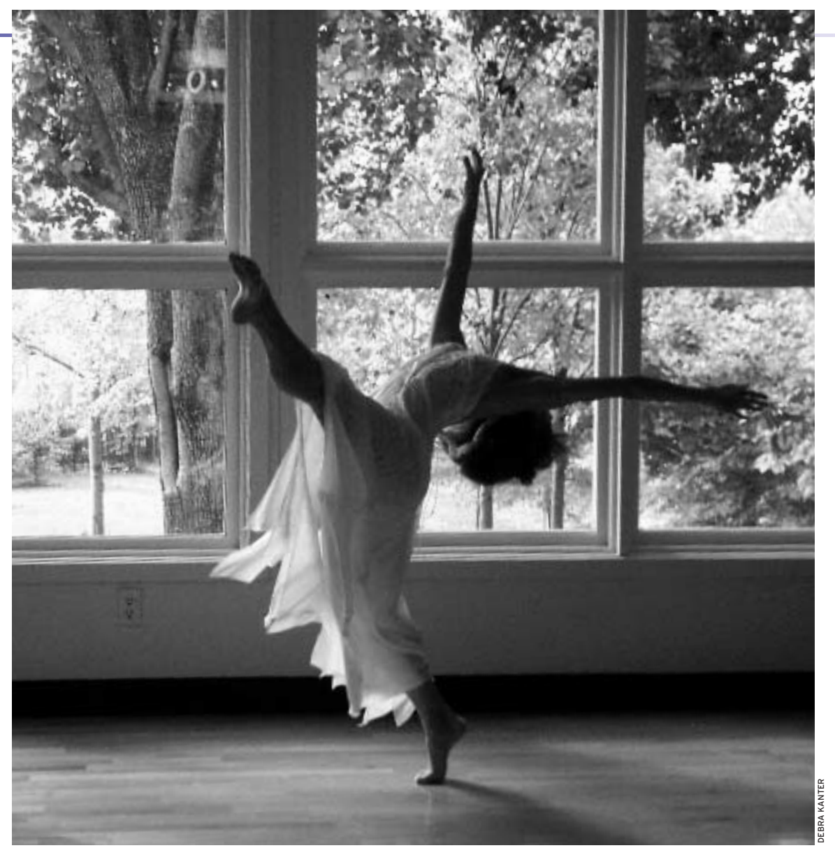
CROSSCURRENTS DANCE COMPANY