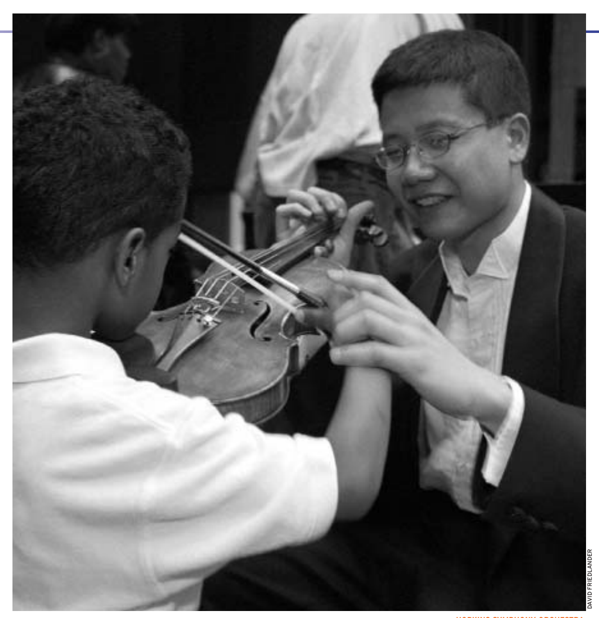
HOPKINS SYMPHONY ORCHESTRA