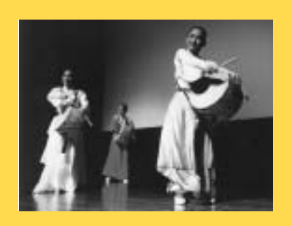
ASIAN ARTS AND CULTURE CENTER QUEEN ANNE'S COUNTY ARTS COUNCIL