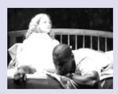
CENTER STAGE ANNAPOLIS CHORALE ROCKVILLE ARTS PLACE

Maryland's non-profit arts industry generated a total of $32.2 million in selected State and local tax revenues in 2002.