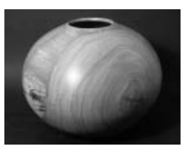
WYE OAK David Fry

APPROXIMATELY 150 MARYLAND ARTISTS TRAVELED TO MARYLAND'S EASTERN SHORE TO COLLECT EVERYTHING FROM TWIGS TO LARGE SECTIONS OF THE WYE OAK'S TRUNK.