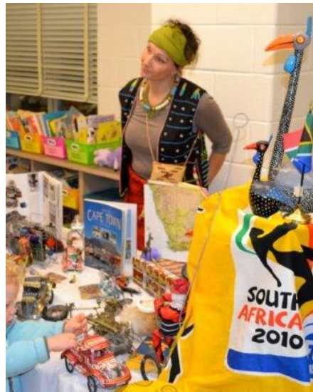
Families helped represent their cultures.