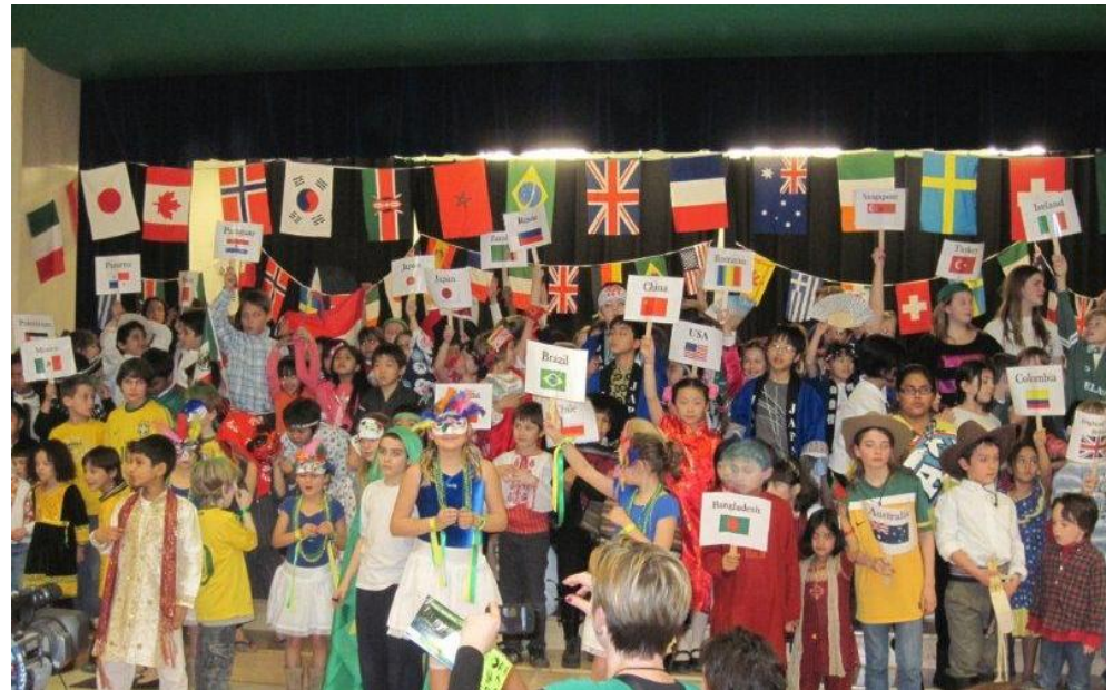
At this year's International Night, held on Saturday, January 28, children represented more than 37 countries, from Algeria to Zambia.